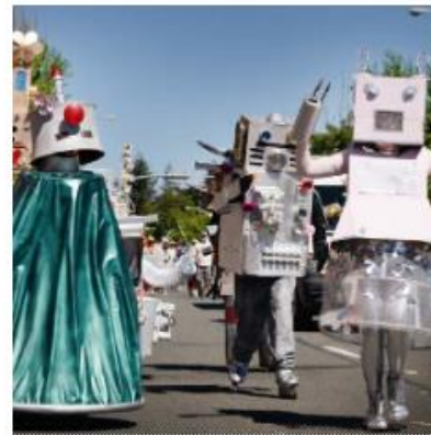
Sebastopol Apple Blossom Festival