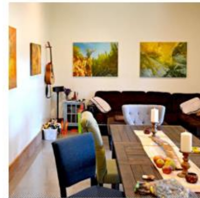
Gravensteins and grapes make peace at Horse & Plow's new tasting room