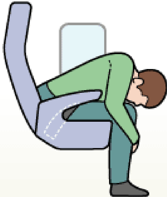
POSITION 1: Head down and hug knees