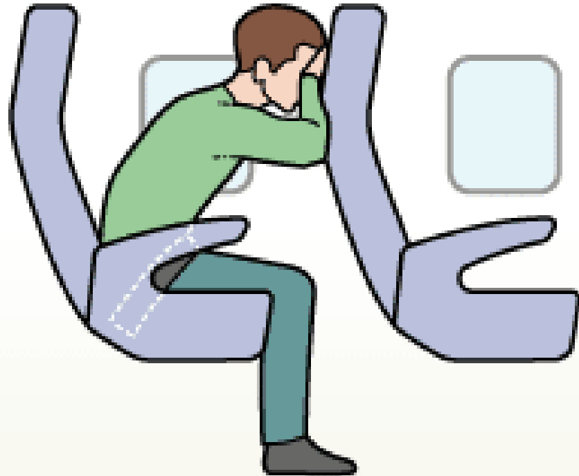
POSITION 2: Cradle head on seat in front