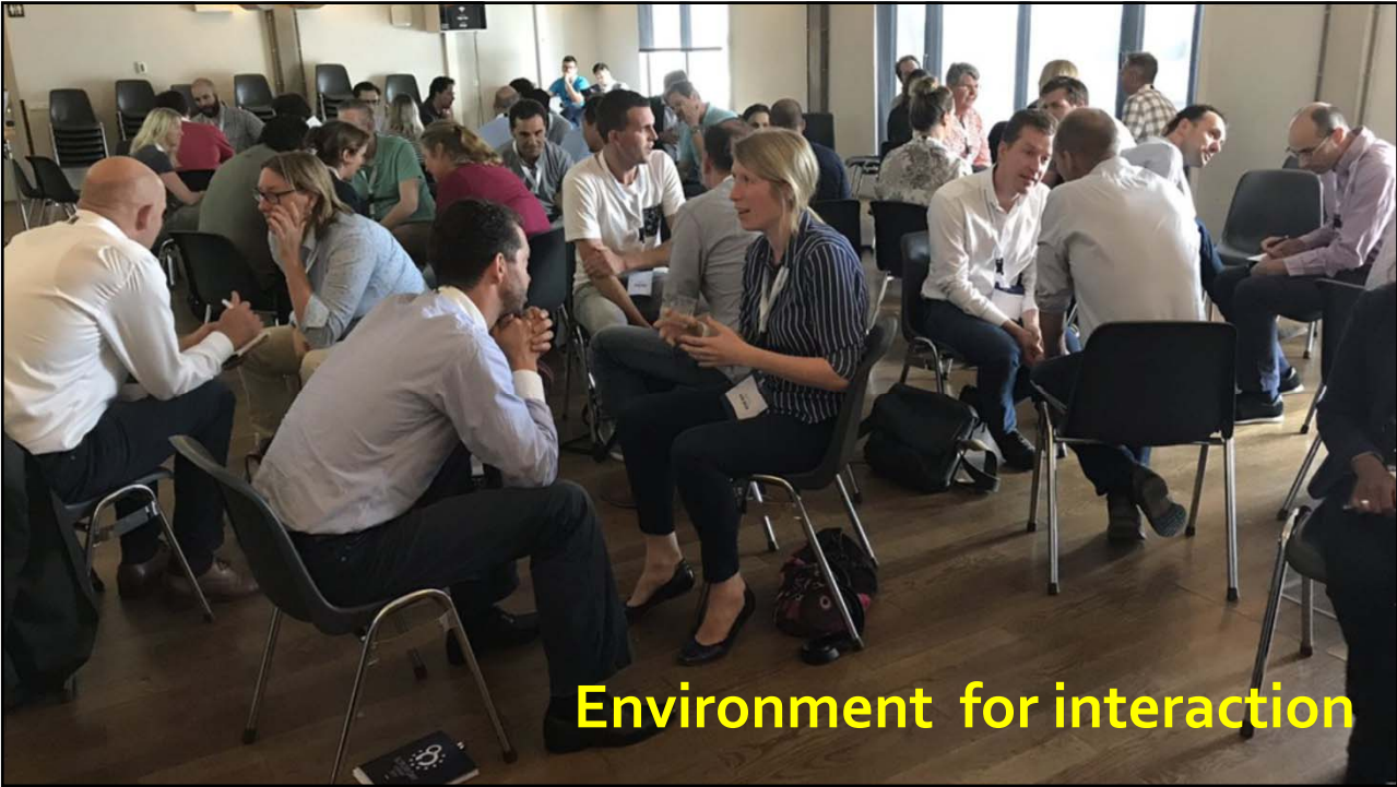
Environment for interaction