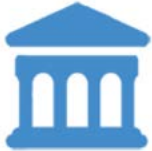
Bank Referral Partners

Referral Program for Banks + Lead Generation for CDFIs = Increased Capital for Businesses