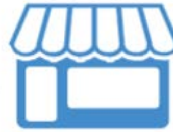
Small Business Owners