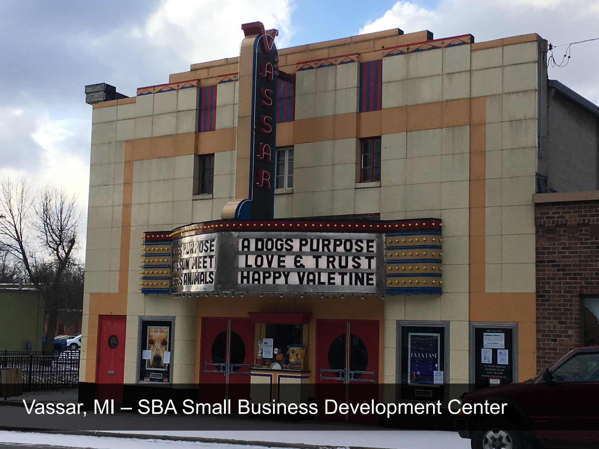
Vassar, MI – SBA Small Business Development Center